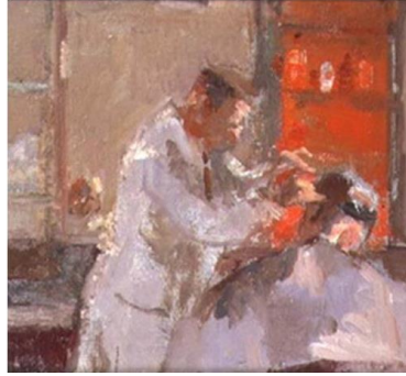
At the Barber's by Ruskin Spear, 1947. Oil on canvas